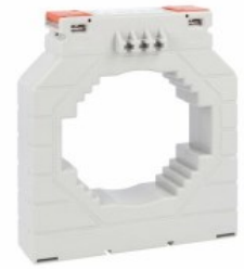
Current trasformers DM4T1250